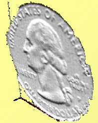
Precision Dimensional Measurement