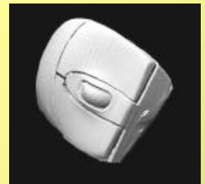
CAD/CAM and Reverse Engineering