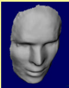
3D Facial Image