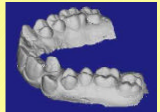
Dental 3D Measurement Using Rainbow 3D Camera

Processing Efficiency: Each image provides a full frame 3D data.