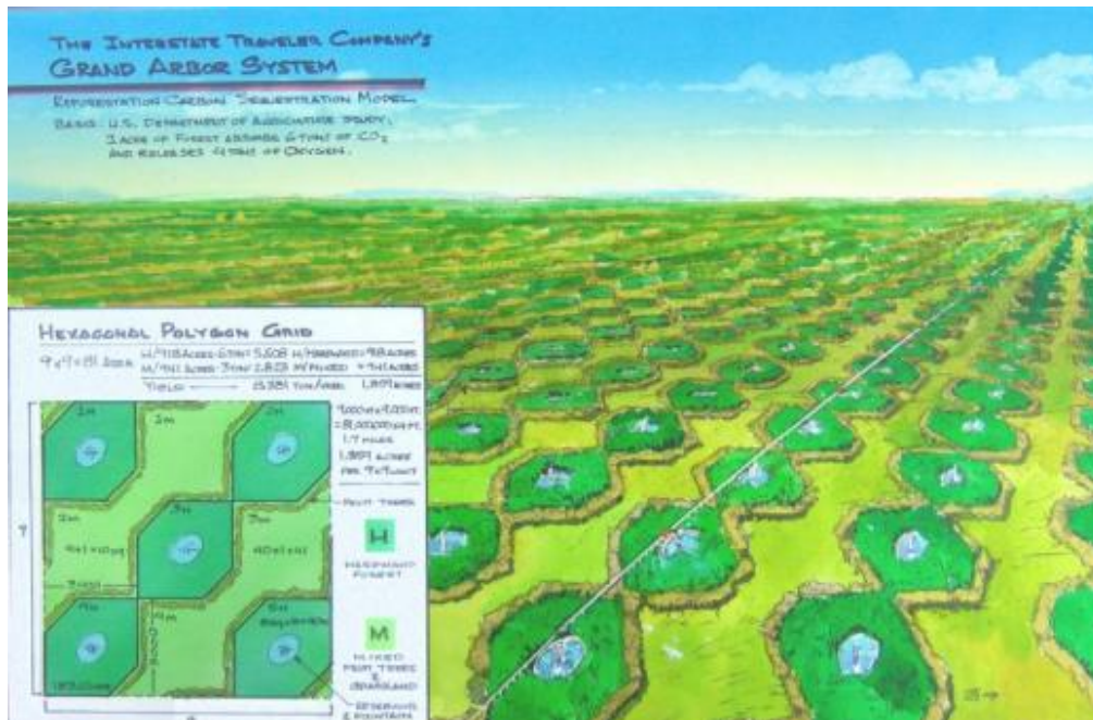
Interstate Traveler Company's Grand Arbor Program