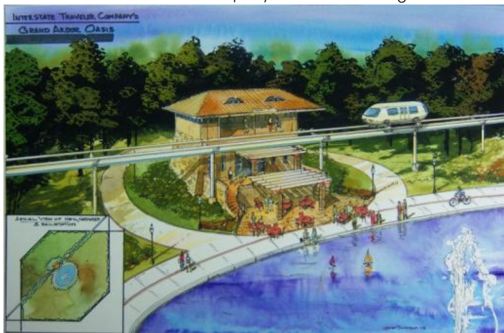
Interstate Traveler Company's Grand Arbor Oasis